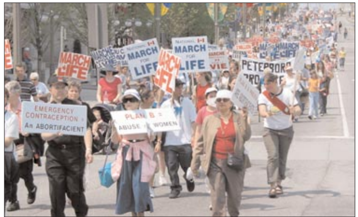
About 4,000 people participated in the March for Life on May 13 as a witness to the injustice of abortion.