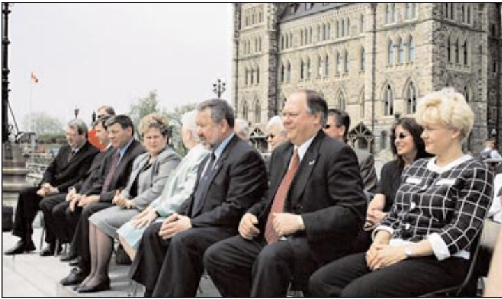
About two dozen MPs spoke at the program on Parliament Hill, including members of both the Liberal and Conservative parties.

different denominations, people from all the provinces, from the newly born to the most veteran of pro-life supporters. We were pleased to see a large contingent of youth that came with parents or friends or their schools. We thank all those teachers and chaperones that brought students to the March for their hard work and commitment in nurturing the next generation of pro-lifers.