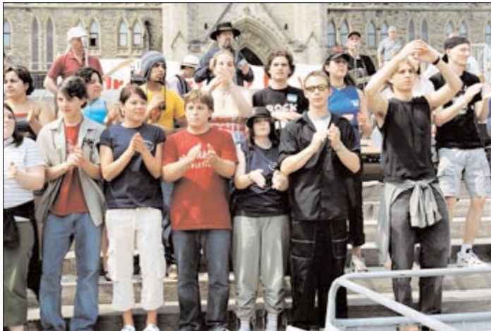
About half of the participants at the March for Life were youth. While many came with their families, there were also numerous schools and youth groups represented at the event.