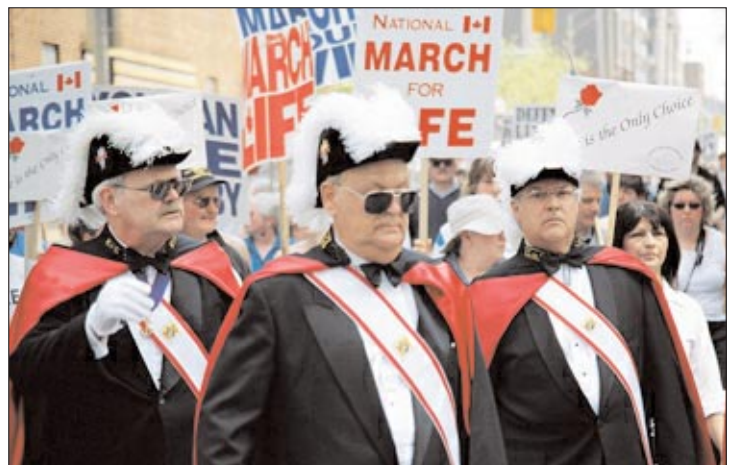
About thirty 4th Degree Knights of Columbus led the March for Life through the streets of Ottawa and presided the Honour Guard for both Catholic services.

Along the route, cars blasted their horns in support and gave thumbs-up signs as the pro-life throng marched with banners and placards with dozens of pro-life slogans. Throughout the crowd there were priests and pastors from