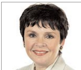
Crusading pro-life MEP Dana Rosemary Scallon lost in her bid to return to European Parliament.

Scallon was a singer and television personality in Ireland before being elected MEP in 1999. Since then, she has opposed the liberalization of abortion and embryonic stem cell research proposed by the European Union. Although other pro-life candidates won elsewhere in Ireland, Scallon's leadership on this issue will be hard to replace and at a time when our friends all over Europe tell us that they expect an even more aggressive push for abortion to be declared a right and for state-funding of embryonic stem cell research. We pray that Europe does not go further down the road of moral decadence and that a Culture of Life is rejuvenated. We are also confident that Dana Scallon will remain a pro-life leader in a new capacity.