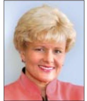
Cheryl Gallant compared abortion to a beheading. The media mocked her but never examined the validity of the comparison. For her courageous and principled stand, Gallant was re-elected with 55% of the vote.