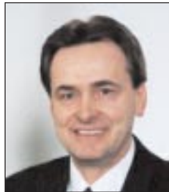
The media used Conservative health critic Rob Merrifield’s comments on abortion counselling to hammer the party for a supposed hidden agenda to restrict abortion, even though Paul Martin mused about counselling on the exact same day.