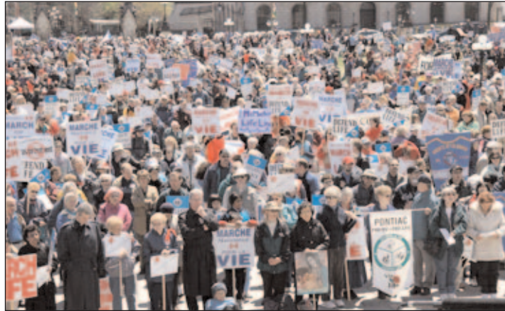
6000 pro-life Canadians stood up for the unborn during the annual National March for Life in Ottawa, May 12. Below were some of the MPs and other speakers who addressed the throng.

At the Rose Dinner, attended by over 500 people, Quebec City Archbishop Marc Cardinal Ouellet said he was "very happy" to be with the gathered pro-lifers. He congratulated Campaign Life Coalition for organizing the March year after year, which, he said, "is bringing forward, little by little, a culture of life." Cardinal Ouellet, who received repeated rounds of applause, recalled his experiences in Rome during the funeral of Pope John Paul II and, later, the Conclave that elected Pope Benedict XVI. "In Rome the population doubled and most of them were