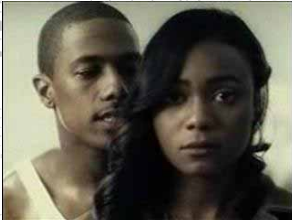
Nick Canon- Can I Live?