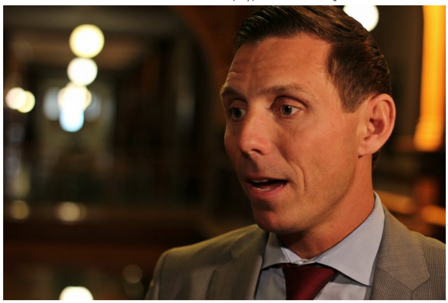
Dissent breaks out over PC policy process 'farce'