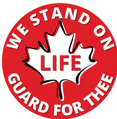
The 2017 National March for Life theme

2017 is a very special year for Canadians as Canada is celebrating its sesquicentennial year and 150th anniversary of Confederation. For Campaign Life Coalition, this year will also mark the 20th time that pro-life Canadians gather in our nation's capital for the National March for Life. Tying together both milestones, the March for Life committee decided to go with the theme "Life, we stand on guard for thee". This theme which uses words from our national anthem aims to remind Canadians that respecting and valuing life at all its stages is and has always been part of our Canadian identity. It is the basic human right upon which all other rights depend on. Our very first Prime Minister Sir John A. MacDonald said that abortion "saps the life blood of a nation", and 150 years later, it's our duty as pro-life Canadians to continue reminding our current Prime Minister, his administration and many other politicians that we will always stand on guard for the most