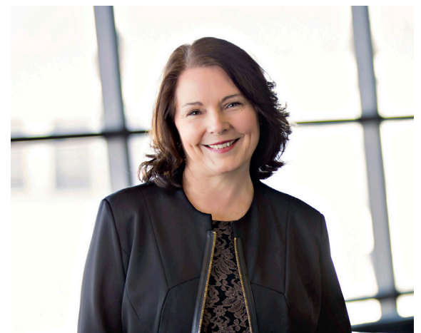
MP Cathay Wagantall.

because of the sex of the baby. It is well established that in some ethnic communities in Canada, prenatal homicide eliminates unwanted girls. Wagantall said that the reason for the bill was to take a stand against gender-based discrimination. Wagantall's colleagues MP Tamara Jansen (CPC, Cloverdale—Langley City) and Kelly Block (CPC, Carlton Trail—Eagle Creek) spoke to the issue of sex-selective abortion, saying that any fight against sexism must include opposition to sex-selective abortion. Wagantall said, "We should not be afraid to have this conversation." But the opposition sidestepped the issue of sex-selective