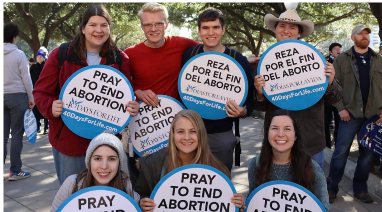
40 Days for Life

The 40 Days for Life vigil kicked off on March 2nd in 13 Canadian cities and continues through to April 10. The movement first came to Canada more than a decade ago when Campaign Life Coalition kickstarted the first prayer vigils outside abortuaries in Toronto, Ottawa, and Halifax. Since then, it has grown and thousands of Canadians have publicly prayed outside abortion killing centres for an end to abortion and for the women entering them.