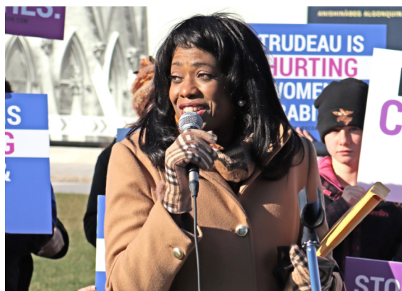
MP Leslyn Lewis at CLC's Save our Charities Rally on Parliament Hill, Nov. 24, 2021.

Since becoming a MP in 2021, Lewis has been a vocal advocate for life, promoting the life-saving work of pregnancy care centres and defending free speech. Lewis spoke at our Save our Pro-life Charities rally last November, stating that what Prime Minister Trudeau is doing to strip crisis pregnancy centres of the charitable status is "just wrong."