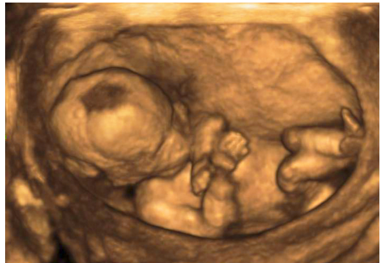
3d ultrasound.