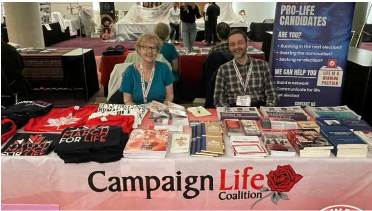
CLC staff at the Lift Jesus Higher Rally.

where they talked to attendees about the sanctity of human life and the need to be more involved in the pro-life movement. This annual event focuses on evangelizing through uplifting music, testimonials, reflections, Divine Mercy celebration and Eucharistic Adoration.