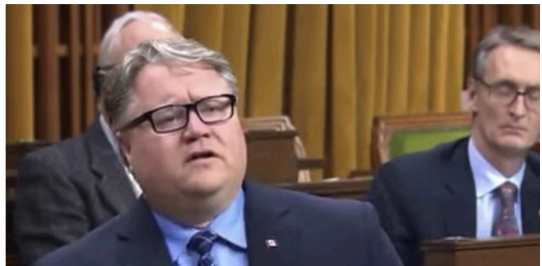
Conservative MP Richard Bragdon (Tobique—Mactaquac, NB) stunned the House of Commons on February 13, 2023.

"Let us bring hope and life. Let us not encourage death or a culture of death but foster a culture of hope and life for those who most desperately need it," he concluded. Bravo to Bragdon for so eloquently capturing the essence of this issue. The entire assisted death regime (MAiD) is about leaving people behind instead of being present to them, shunning them instead of building relationships with them, and finally, killing them instead of caring for them. The only way to reverse course is for each one of us, personally, to begin to build meaningful relationships with the sick and the elderly in our communities, giving them a reason to hope and to live. The culture of death can only expand in a culture of abandonment. So, let us be present to those around us. Let us build meaningful relationships. And, let us not hide our light under a bushel basket.