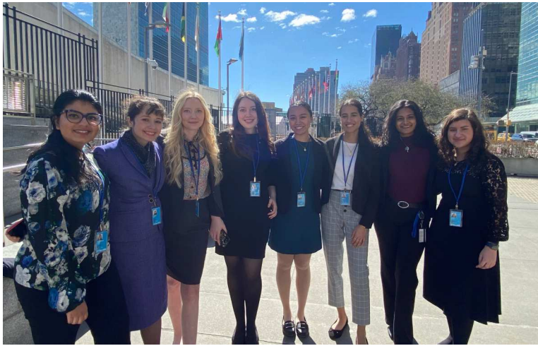
CLC team at the UN in New York City, March 6, 2023

In the mid-1990s we sent groups to the major conferences in Beijing, Istanbul, and Lisbon, but recently we have been focused on the annual Commission on the Status of Women at the UN in New York City. We sent eight youth delegates – all young women – to this year’s ongoing 67th Commission on the Status of Women at the United Nations. Our delegates created quite the buzz as we defended life and family. All of these young women were former CLC summer interns, and one of them was kicked out of a session simply because she was affiliated with CLC – that is, for being pro-life. Yes, the Commission on the Status of Women kicked a young woman out of an event because she did not share the organizers’ radical views on killing preborn babies.