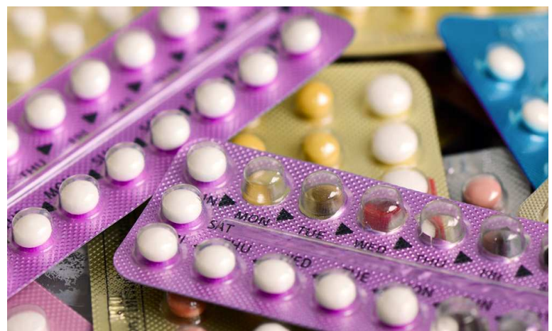
Hormonal contraceptives.